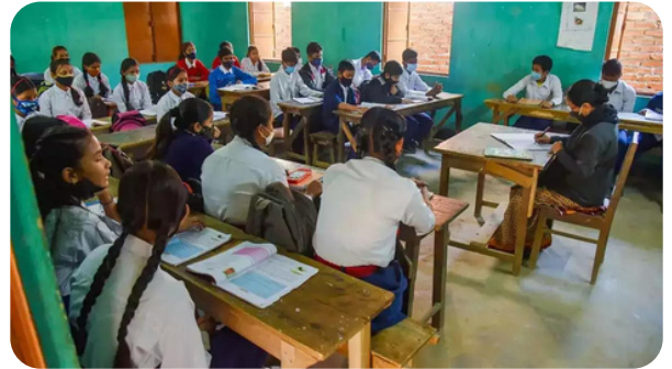
School Students attending classes

Entry age of 3 years for Nursery has been notified by Directorate of education. The Directorate had intensive discussions with stakeholders and Goa Board has conducted orientation programmes for its BOS members and Board members by involving SCERT Faculty members. Efficient resourcing and Effective governance through school complexes will be promoted. The teachers in the anganwadis have been included in the training of ECCE i.e. National Initiative for schools heads and Teachers Holistic development (NISHTHA). These factors will definitely contribute to Universalization from ECCE to secondary Education by 2030.