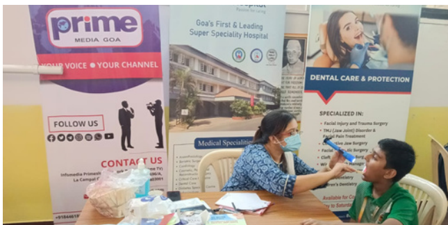
KIDS HEALTH CHECKUP IN ASSOCIATION WITH VICTOR HOSPITAL AT DAMODAR SCHOOL, MARGAO