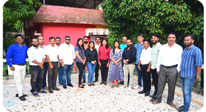
File Photo : Year 2023 : Prime Media Goa Team

Keeping with its futuristic technology, outlook and reach, Prime has launched the Prime App for the android users . This android app will keep you in touch with the latest happenings on your favourite channel.