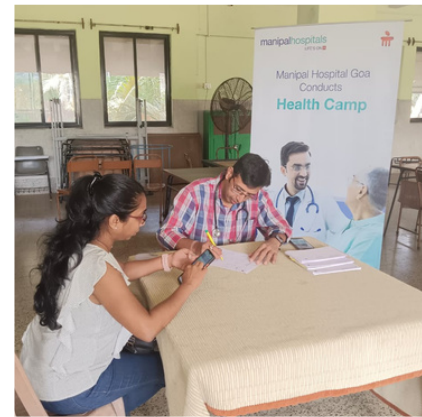
WOMEN'S HEALTH CHECK UP AT DON BOSCO COLLEGE,PANJIM.GOA