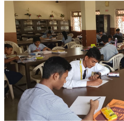
POSTER COMPETITION AT ST.THOMAS HIGHER SECONDARY SCHOOL,ALDONA GOA

Through this event PRIME created multiple activities for people of various age groups right from health camps to events that brought about a social awareness to Say No to Plastic with Wealth out of waste to Poster Competition of how one can Be the Prime Change. Additionally PRIME TV launched Blood Bank Directory- to create authentic blood bank list and Job Directory - to create unemployment list to help people searching for jobs. An approximate of 5000+ people joined hands through this mahotsav.