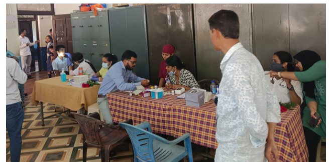
KIDS HEALTH CHECKUP IN ASSOCIATION WITH WISDOM HOSPITAL AT SUNANDBAI SCHOOL, POVORIM