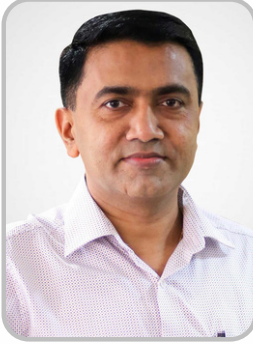
DR. PRAMOD SAWANT CHIEF MINISTER, GOA