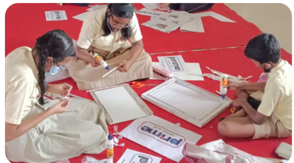
WEALTH OUT OF WASTE COMPETITION AT JYAN VIKAS SCHOOL, PORVORIM GOA